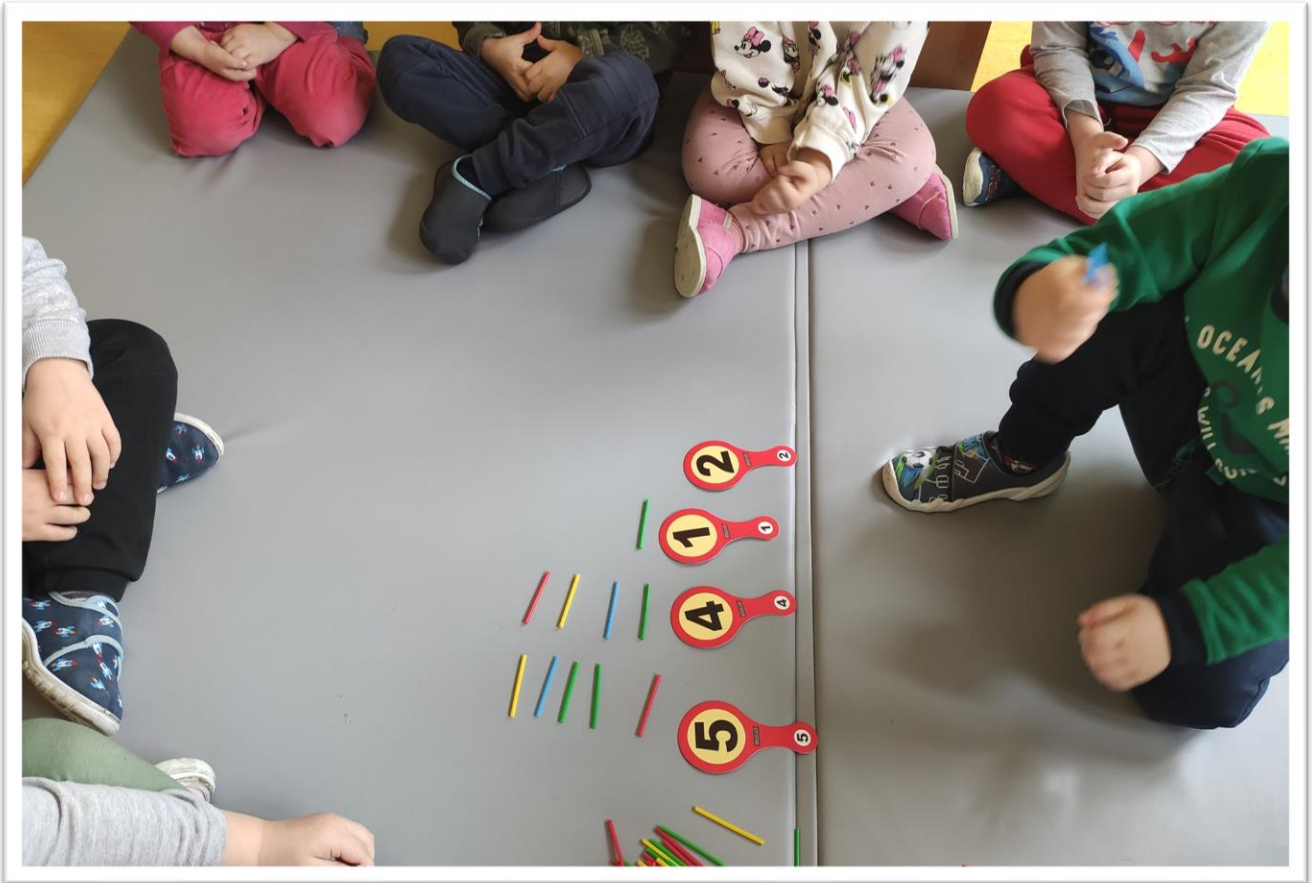
Kindergarten Nr. 106, Warsaw, Poland.