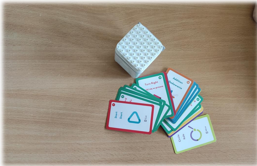
Kindergarten Nr. 106, Warsaw, Poland